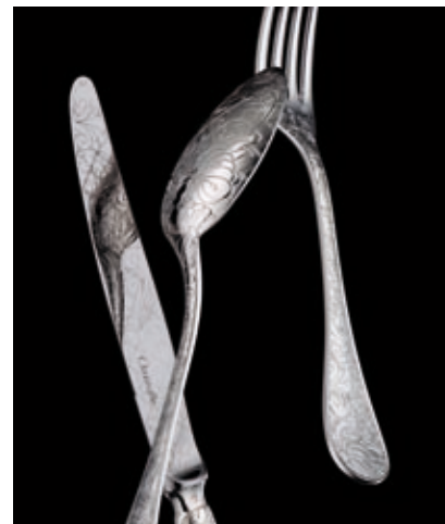
CUTLERY JARDIN D'EDEN, 2011