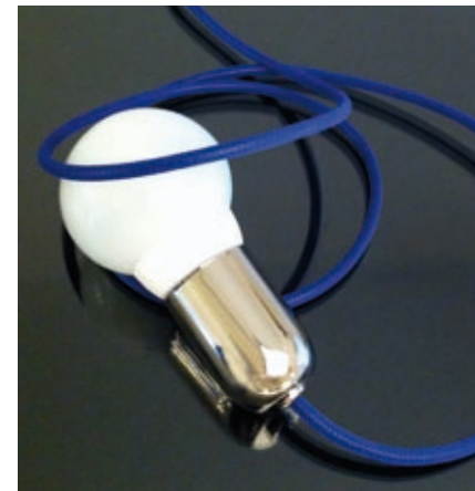
BALL LIGHT, 2010 DESIGN: CHRISTIANE BÜSSGEN