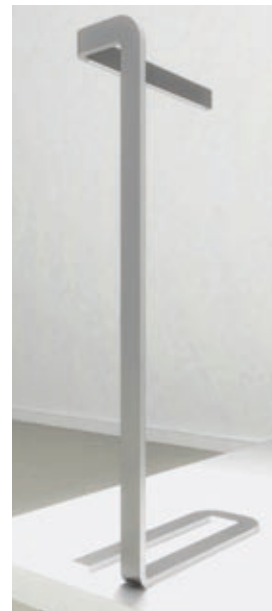
«FLAT» LAMP, 2010