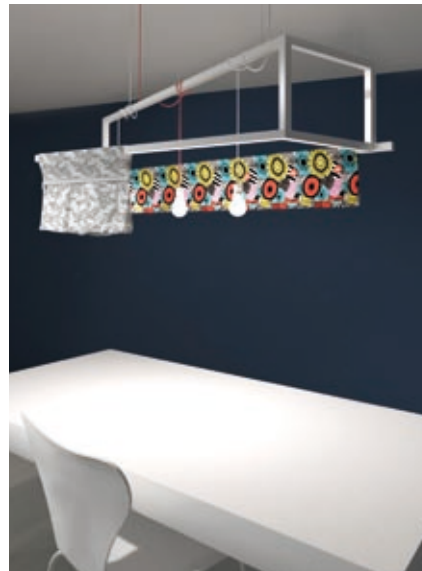
CEILING LIGHT «LUMINITSA», 2011 DESIGN BY SERGIO MANNINO, FRANCESCA SCALETTARIS