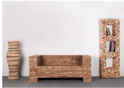
LUXURY DWELLING, 2011