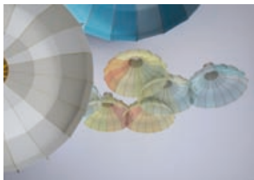
JS LAGRANGE. LAMPE BOO, 2011 IN PARTNERSHIP WITH ARJOWIGGINS