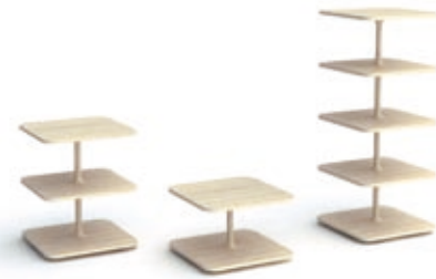
SHELF DIADEM, 2011