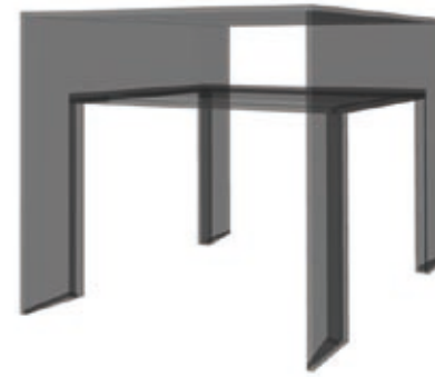
023 LOW TABLE, 2011