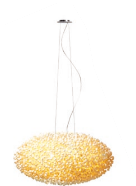
CEILING LIGHT «PARADISE», 2006