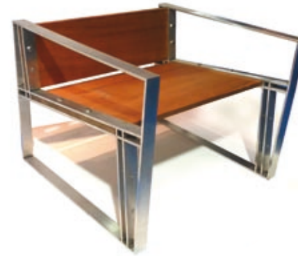
SEPARATE STEEL CHAIR, 2010