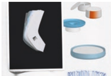
GREGORY LACOUA. PAPER BOWL, 2011 IN PARTNERSHIP WITH ARJOWIGGINS