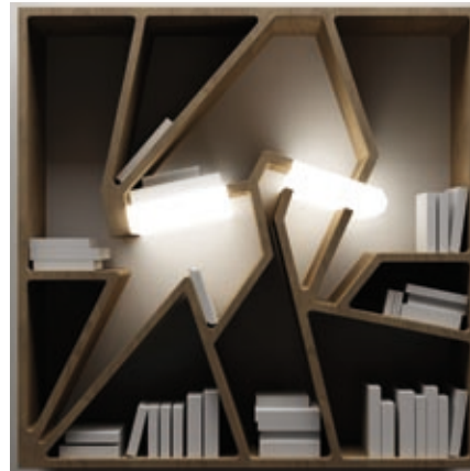
GRAFFITEK SHELF, 2008