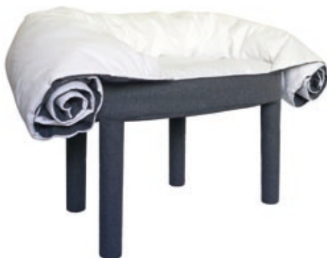
FOOTREST/SEAT «COLERETTE», 2011 DESIGN BY CELINE MERHAND AND ANAÏS MOREL