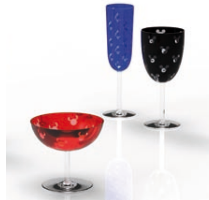
BEBIÉNDOTE INFANZIA, 2011